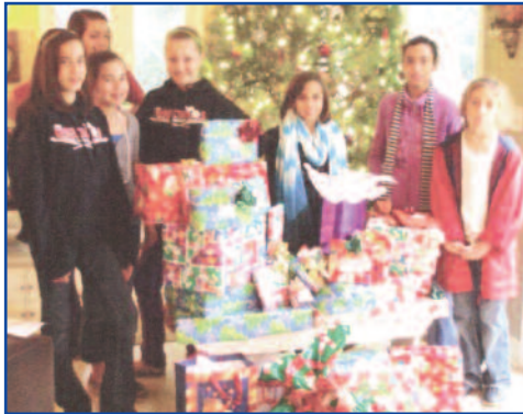
Children of Onslow Alliance Members Help Wrap Donated Gifts for the Emergency Dept. Toy Box

During the recent holidays, on the very day the toy box arrived in the Emergency Department, an unusual situation presented itself. A family arrived with an ill grandmother and was very distraught. During the time the grandmother was being treated, the family received a call alerting them that their home was on fire. Sadly, there was so much damage that most of their belongings including their gifts for the children were lost. The nursing staff presented the family with several gifts from the box and the family was completely overwhelmed. Although the toys couldn't replace the loss of