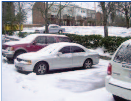
Oh, Snow! Raleigh experienced its first significant snow in years during the conference.