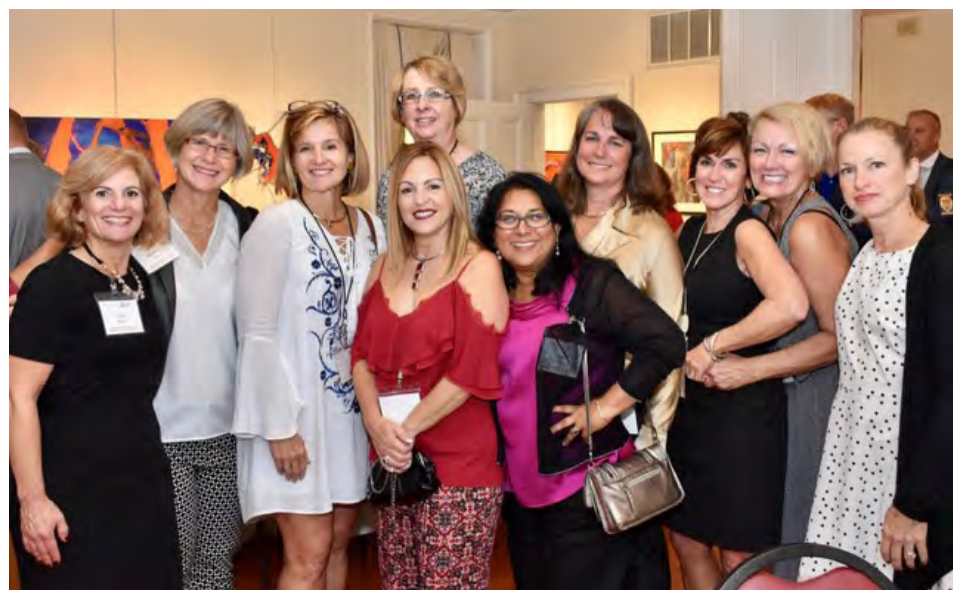
VIP Event, Alliance Members