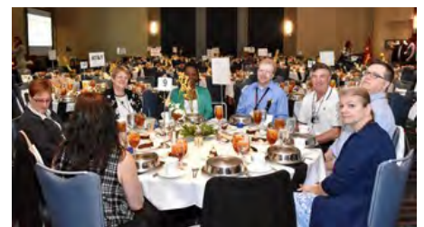
Raleigh Conference Sold Out

Education Opportunity Fund towards the three day conferences and events and nine Drugs Uncovered: What Parents & Other Adults Need to Know programs around the state with objectives to raise awareness about