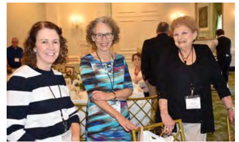
Greensboro Conference, Greensboro Alliance Members