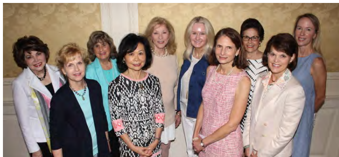
Mecklenburg Medical Alliance Board of Directors 2016-17