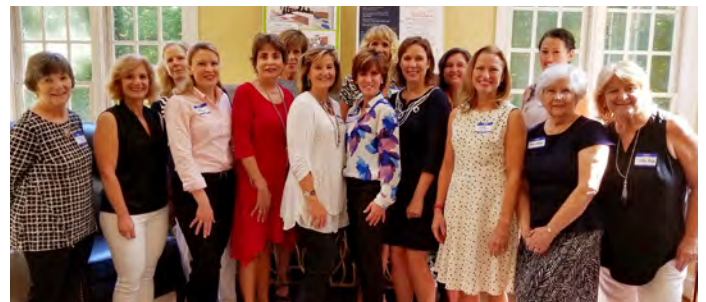
Wake County Java Jumpstart